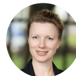
Mrs. Maranatha Sweet Elementary